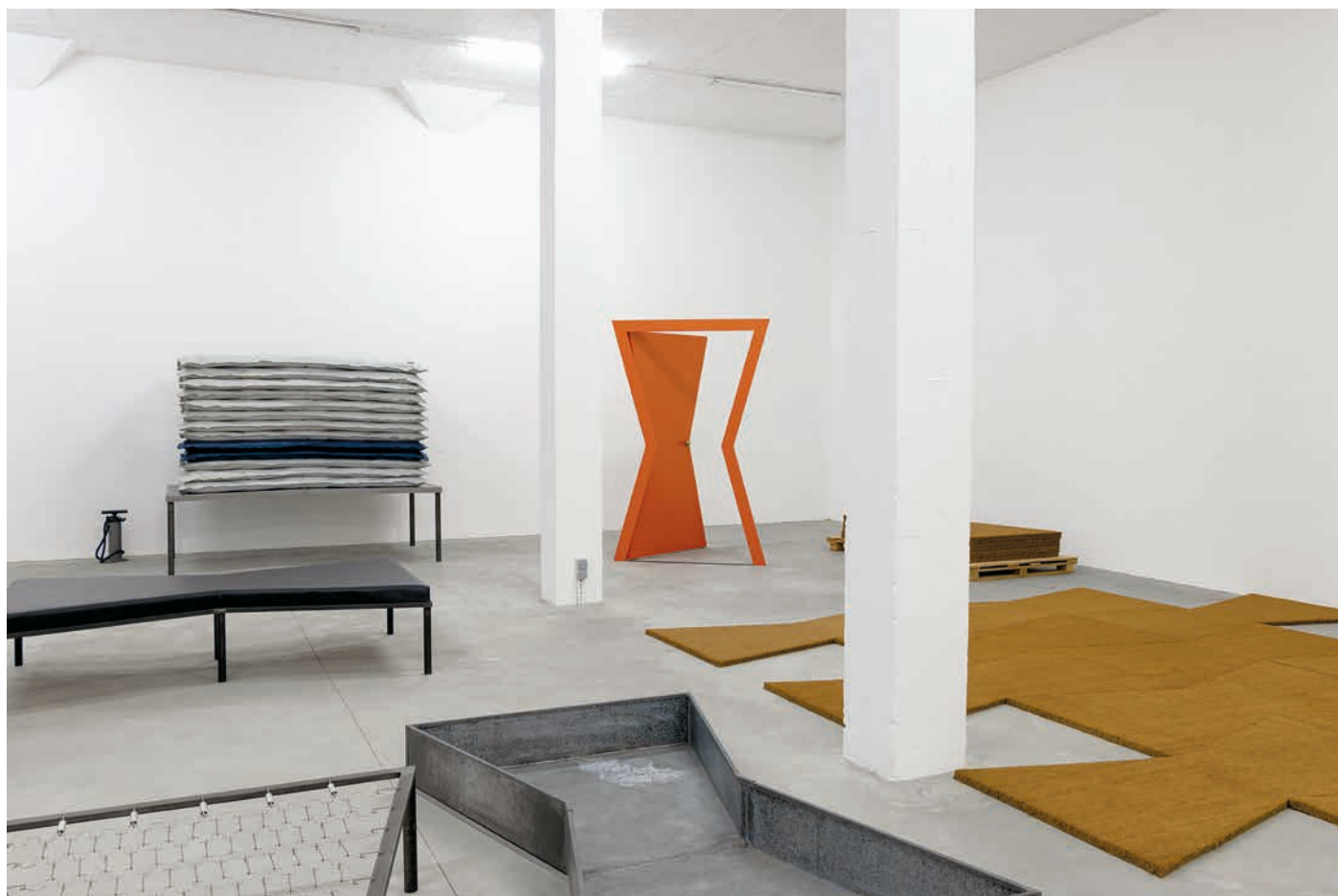
Michelangelo Pistoletto, Segno Arte - Unlimited , 1976–2008 (Herbert Foundation, 2021). © Michelangelo Pistoletto

Distance Extended / 1979–1997 Works and Documents from Herbert Foundation. Part II