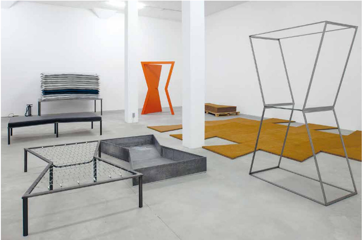
Image 6: Exhibition view Distance Extended / 1979–1997. Part II with work by Michelangelo Pistoletto