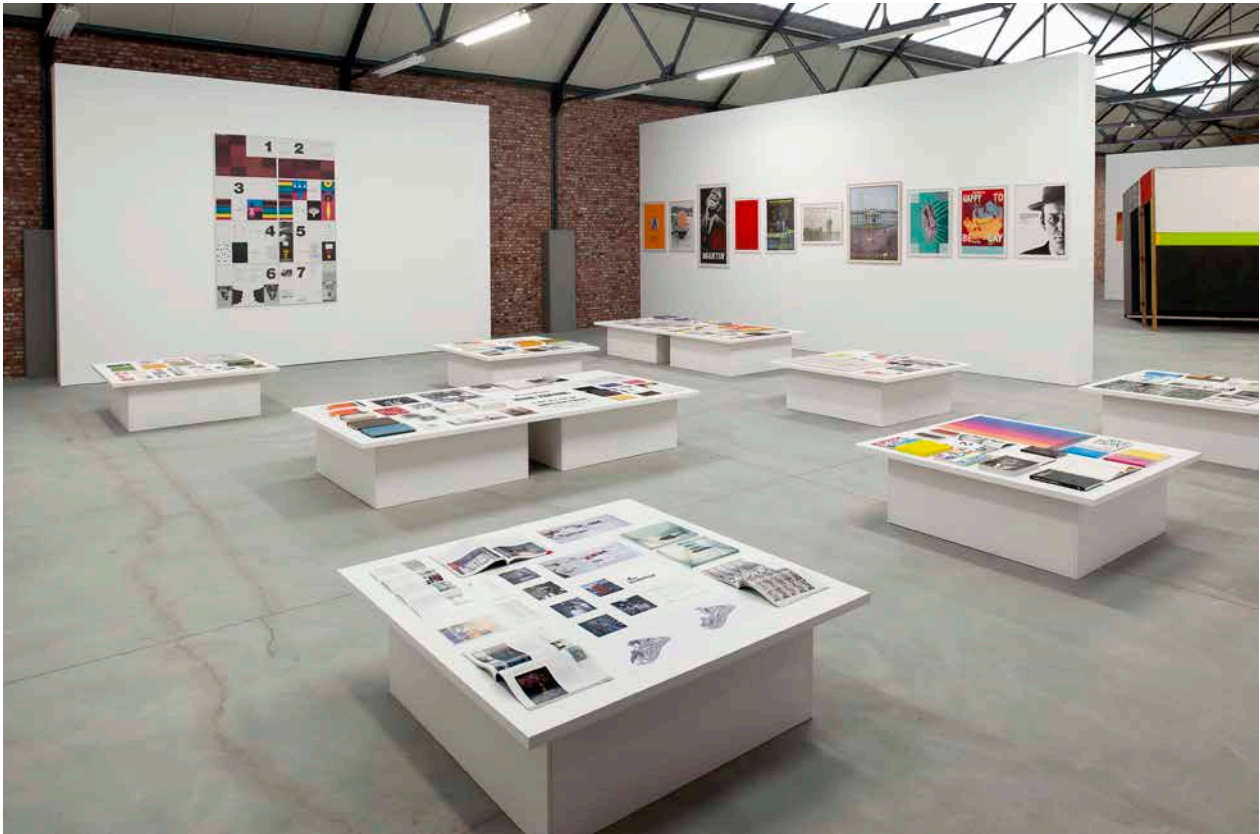
Image 1: Exhibition view Distance Extended / 1979-1997. Part II with works and documents by Martin Kippenberger and Heimo Zobernig

Please mention the numbering of the requested photographs.