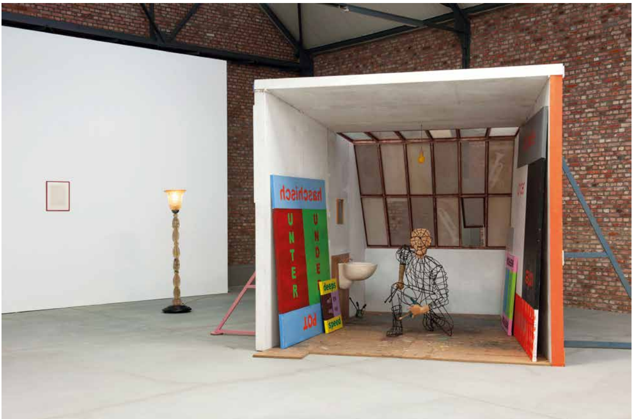
Image 5: Exhibition view Distance Extended / 1979-1997. Part II with works by Martin Kippenberger