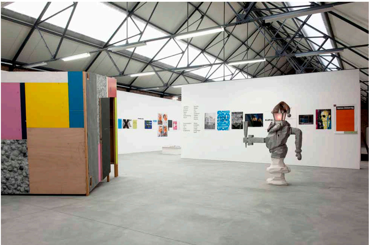
Image 3: Exhibition view Distance Extended / 1979-1997. Part II with works and documents by Martin Kippenberger and Heimo Zobernig